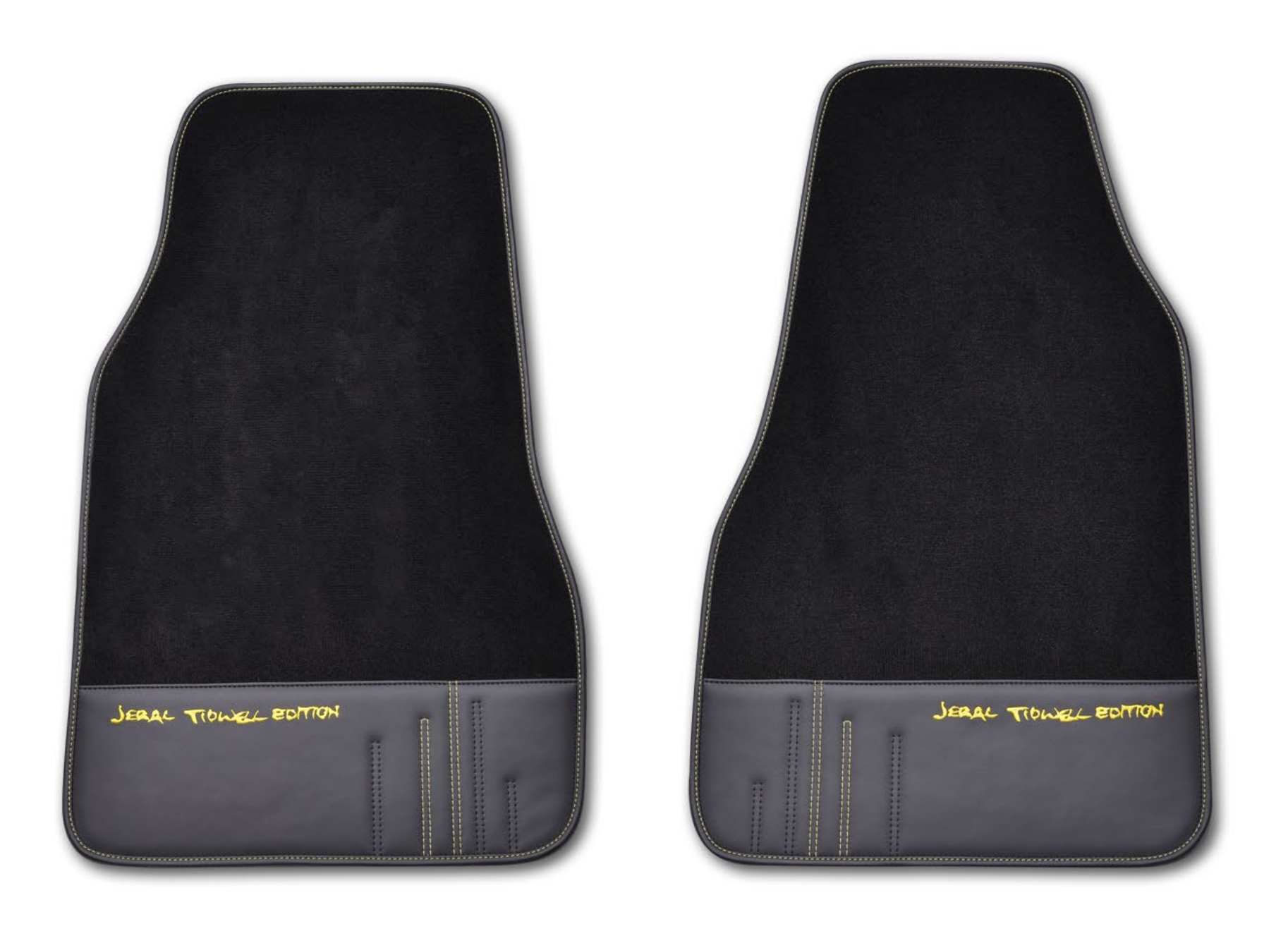
ADDITIONAL FLOOR MATS 1-ST LINE / 2-ND LINE / 3-RD LINE